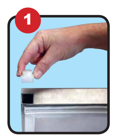
STEP 1 Insert nylon pivot bushing into the square opening at the bottom of the door. This is a simple push-in procedure.