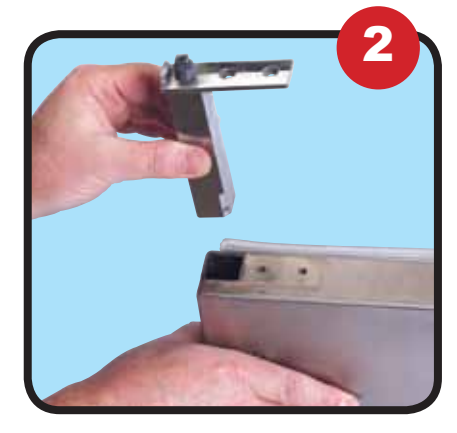
STEP 2 Insert spring cartridge into the square opening at the top of the door. Secure the cartridge to the door with two countersunk screws.